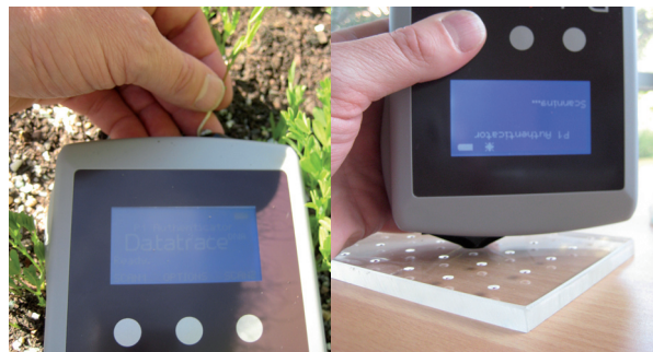
Above: Reading of IntelliSeed tracers